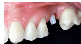
Alternative: ceramic solution