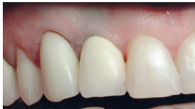
Recession of the gums around a titanium implant